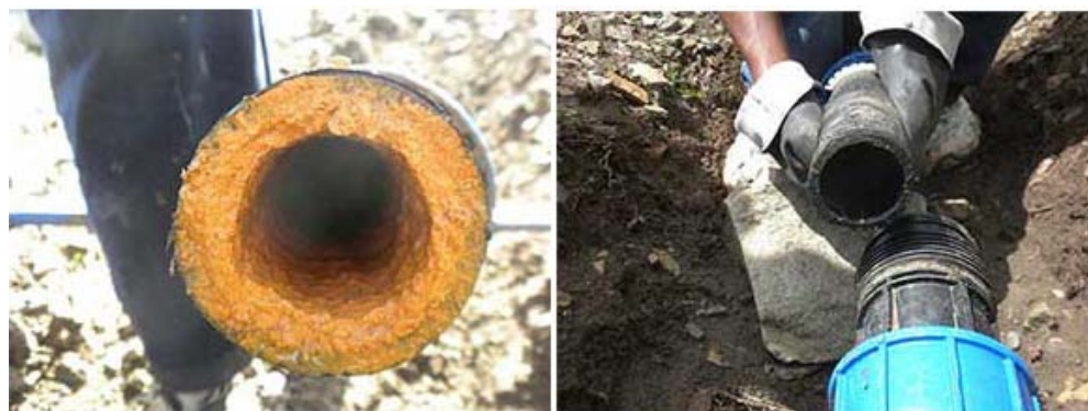
Pipe capacity at 30 meters before treatment.